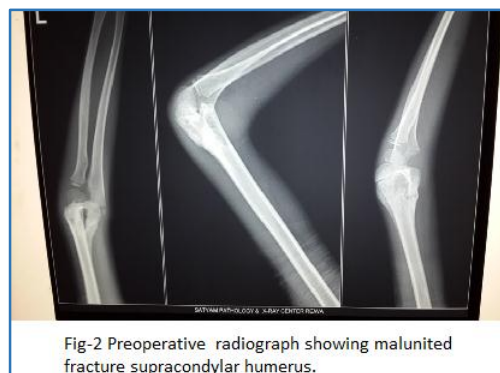
Fig-2 Preoperative radiograph showing malunited fracture supracondylar humerus.