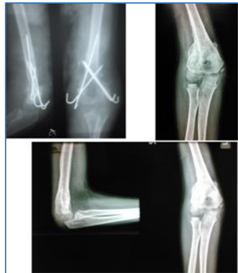
Fig-4 Radiograph of Immediate postop period and follow up at 6th month.