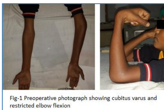
Fig-1 Preoperative photograph showing cubitus varus and restricted elbow flexion